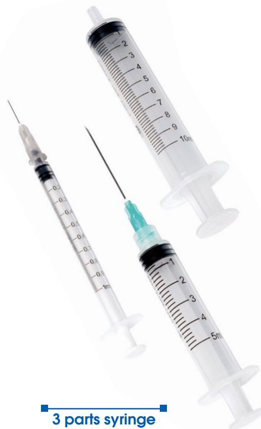
3 parts syringe