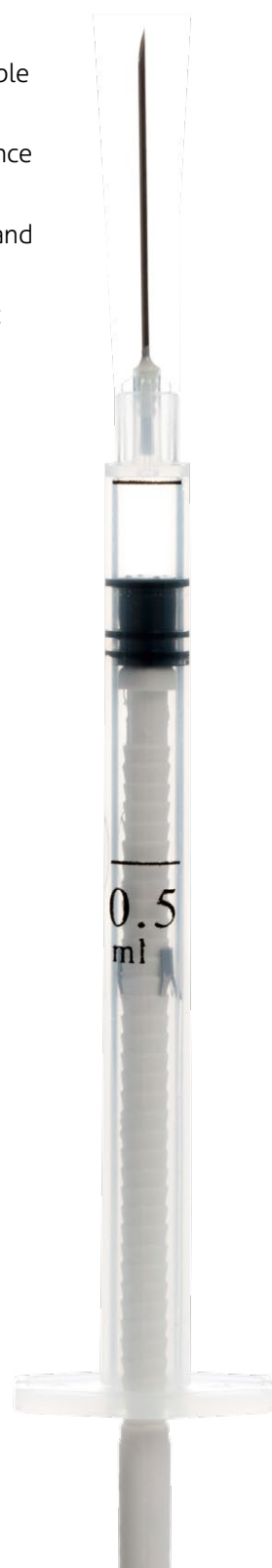
Type 1, With integrated needle