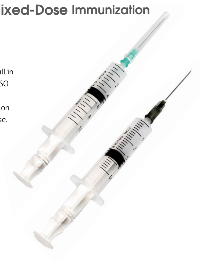
Type 2, With non-integrated needle