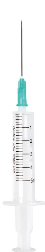
2 parts syringe