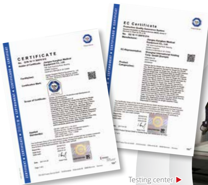
Testing center ▶