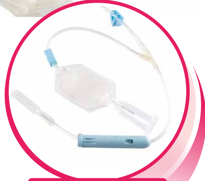
Sampling device & safety needle protector