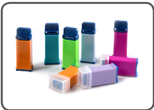
Safety Blood Lancet