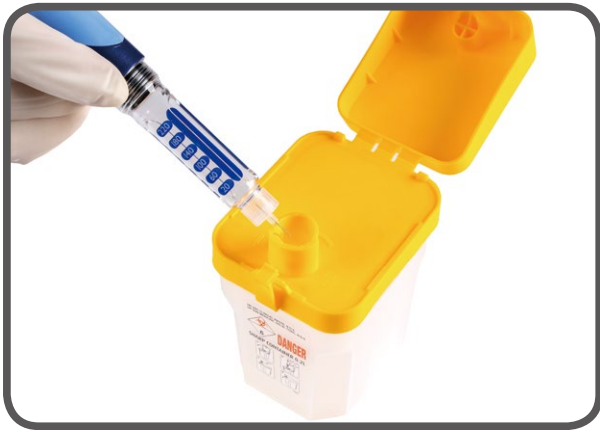
Sharp disposal container