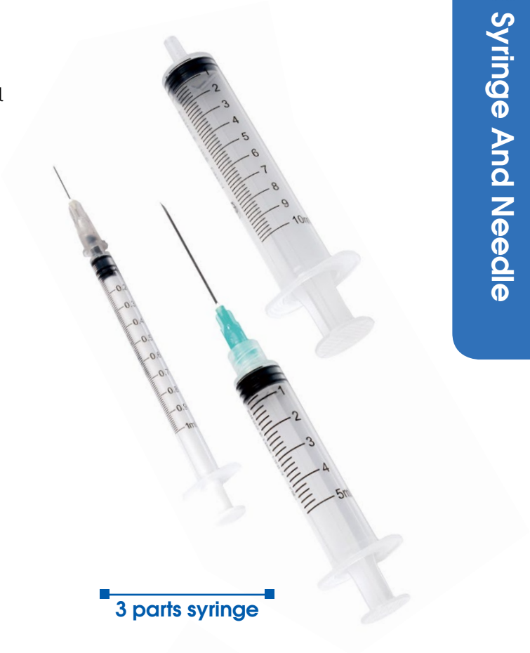
3 parts syringe